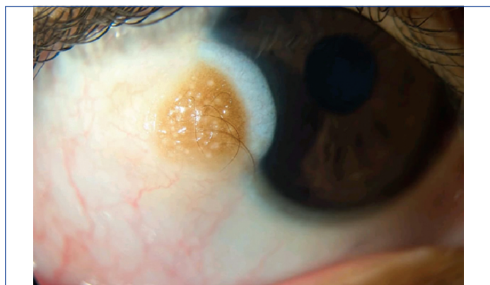
[Table/Fig-1]: Preoperative photograph showing the presence of hairy whitish mass in the temporal limbal region on the right eye, consistent with dermoid cyst.

For the diagnosis and treatment of orbital and ocular dermoid cysts, Computed Tomography (CT) and Magnetic Resonance Imaging (MRI) are essential, especially when lesions are deep-seated or close to important structures [3]. For preoperative planning, CT is particularly helpful in pinpointing the precise anatomical position, evaluating bony involvement, and detecting distinctive characteristics such as fat density, calcification, bone remodelling, or scalloping [4]. Particularly in complex cases involving proximity to the optic nerve, extraocular muscles, or intracranial structures, combined CT and MRI imaging allows for precise assessment of lesion size, tissue involvement, rupture, inflammation, and cyst characterisation, thereby guiding appropriate surgical or conservative management [5]. Early detection and adequate surgical excision are critical to